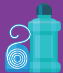
Limited Oral Hygiene

You deserve better dentistry. Visit waterlase.com