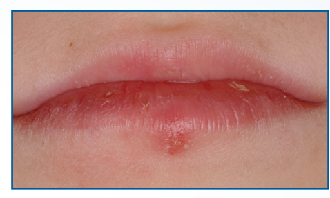
Same lesion after several seconds of treatment with the Waterlase laser. Patient reported immediate pain relief.