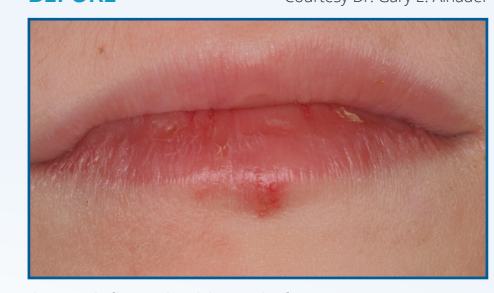
Large, inflamed cold sore before treatment.