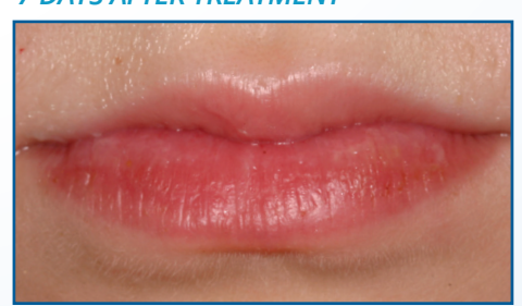
Inflammation is gone and treated area is completely healed.